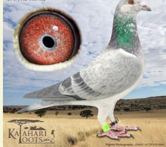
'Bliksem Baklei 302'